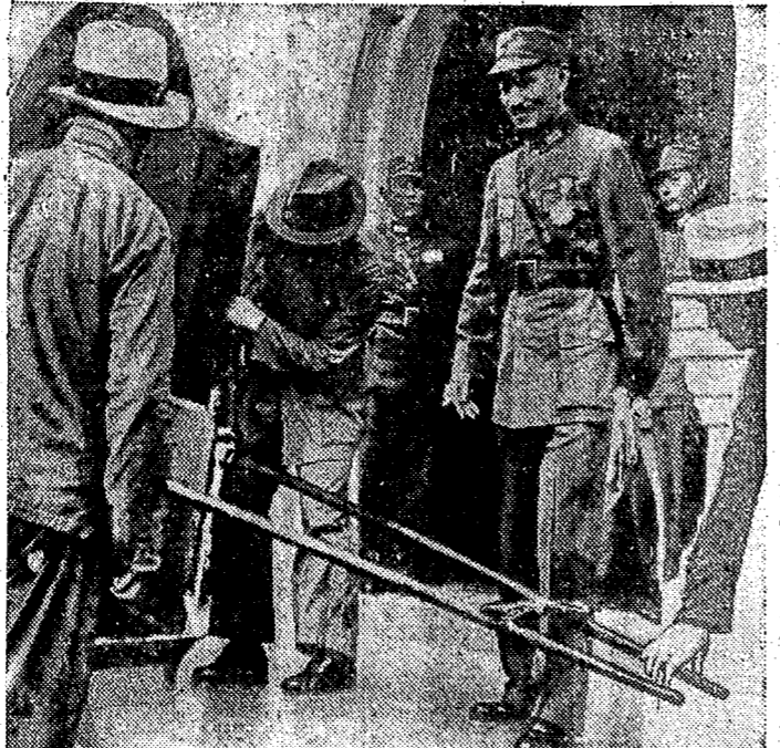
Generalissimo Chiang Kai-shek, under whose personal control the financial and economic resources of all China were placed in the struggle against Japanese aggressions in the north...