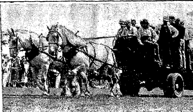
These horses and the other competing teams at the recent Farmers' Day held at Michigan State college proved stronger than the machine that was set up to measure their strength...