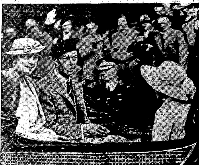
King George VI and Queen Elizabeth, with their two daughters, Princess Elizabeth and Princess Margaret Rose, are shown in a carriage drawn by the famous Windsor grays on their way to attend services in the Crathie church in Aberdeenshire, Scotland.