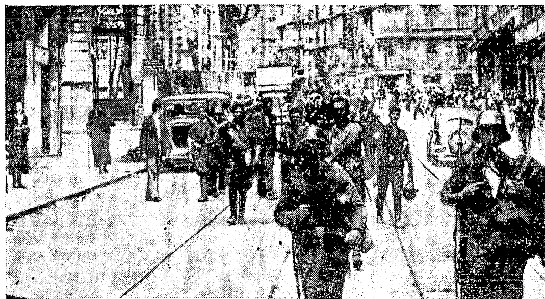
First rebel troops to enter Bilbao, the capital of the Basques, on its capture after an 80 day siege...