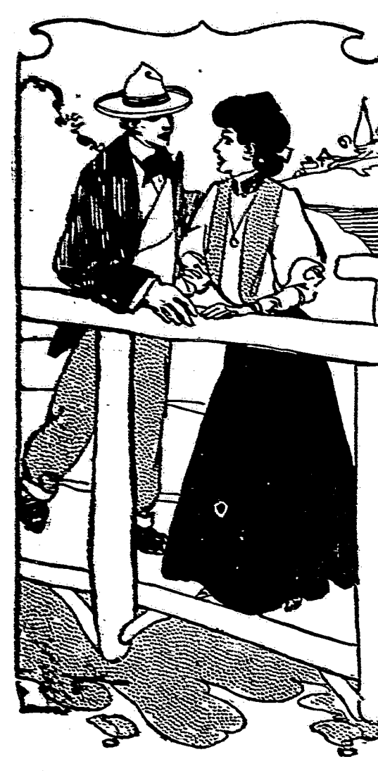
A BEOWN HAND CLOSED OVER HER SLEN

Until her mother's death Vesta had been shielded from all troubles. After she had come back from the little