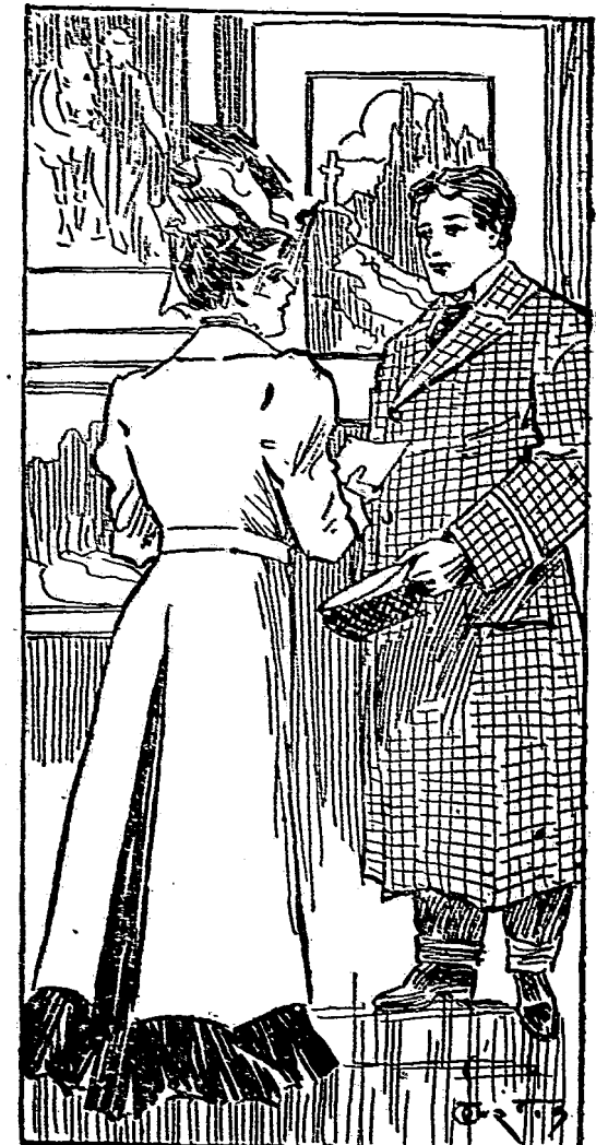
"ARE YOU GOING BACK TO IOWA TO TEACH SCHOOL?"

"If you had taught school in Iowa as many terms as I have," said she, "if you had slaved and saved and look-