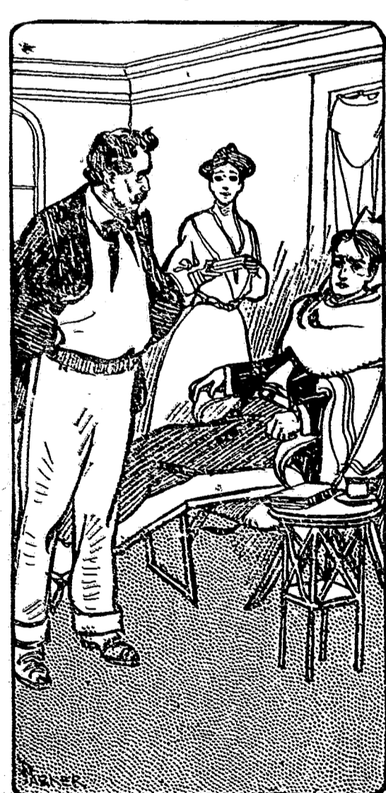
"Did he indeed? On what conditions?"

Maurice still hesitated, bewildered, at a loss, such as men are when a seemingly secure secret is suddenly discovered to the world. He would still have tried to fend it off, but Jack Meredith with his keener perception saw that