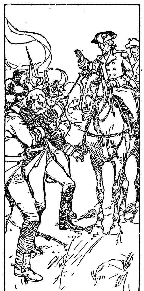
Colonel Rahl, supported by two servants, presented his sword.

Things were not quiet on the Pennsylvania side of the river either; there were such comings and goings in Newtown as that staid and conservative village had never before seen. Our two friends, the sad hearted, were both busily employed. Talbot had galloped over the familiar road and had electrified the good people of Philadelphia with his news and then had hastened on to Baltimore to reassure the spirits of the frightened congress. Honest Robert Morris was trotting around from door to door upon New Year's morning, hat in hand, begging for dollars to assist his friend George Washington and the cause of liberty and the suffering army; and Seymour, become as it were a soldier, and with Philip for esquire,