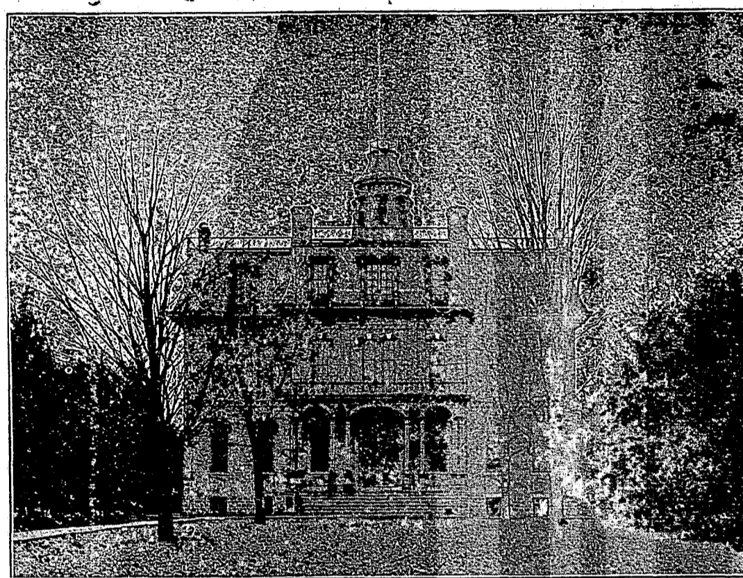
Buchanan High School Building.