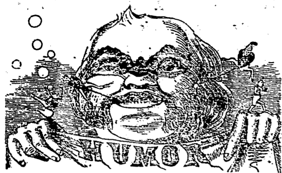
Anecdotes of the Letter "A."

There is living on Martha's vineyard an old man who has never been off the island and the extent of his knowledge is bounded by the confines of his home. He has been told of a war between the North and South, but as he has never heard the din of battle nor seen any soldiers, considers it a hoax. He is utterly unable to read and is ignorant to the last degree. An excellent story is told of his first and only day at school. He was quite a lad when a lady came to the district where his father resided to teach school. He was sent, and as the teacher was classifying the school, he was called up in turn and interrogated as to his former studies. Of course he had to say that he had never been to school and knew none of his letters. The schoolmistress gave him a seat on one side until she had finished the preliminary examination of the rest of the scholars. She then called him to her, and drew on the black board the letter A, told him what it was, and wished him to remember how it looked. He looked at it a moment, and inquired (he stammered):