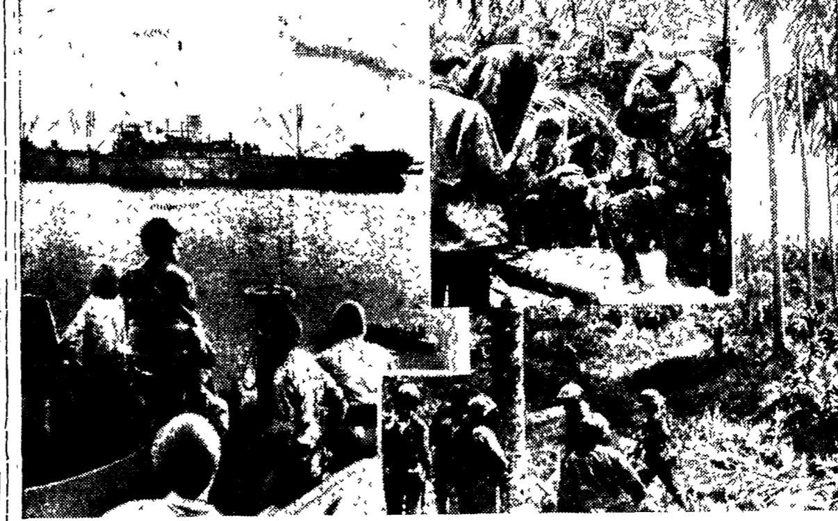
United States marines are shown as they battled their way through vicious Japanese defense tactics to form a six-mile-long beachhead on Bougainville island in the South Pacific.