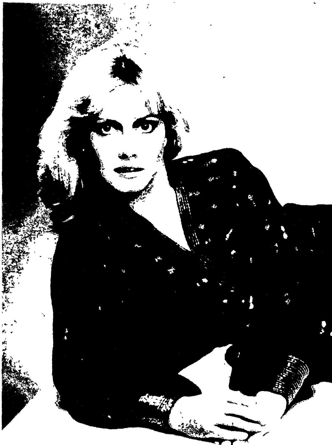
LET'S GET PHYSICAL , an exciting new special showcasing the talents of beautiful Grammy Award-winner Olivia Newton-John , will be broadcast Monday, February 8 on ABC-TV. The special is a high-energy workout as Olivia performs everything from old favorites to modern rock.