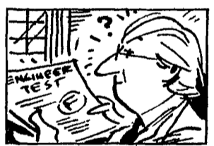
Famous architect Frank Lloyd Wright studied engineering at the University of Wisconsin; the school had no course in architecture.

(69) HOSPITAL (70) SPECIAL REPORT (71) CITY DESK (72) SPORTSCENTER (73) NEWS WRAP-UP (74) NITE OWL (CONTINUES) (75) NEWSMAKERS (76) MEDITATION (77) NHL HOCKEY Quebec Nordiques vs Washington Capitals (R) (78) MOVIE - (DRAMA) *** "Kiss Tomorrow Goodbye" 1950 James Cagney, Barbara Payton Escaped convict marries a wealthy heiress against her father's wishes Later he is confronted by the sister of the man he murdered escaping. (2 hrs, 5 mins) (79) REFLECTIONS (80) MOVIE - (MYSTERY) ** "Scarlet Claw" 1944 Basil Rathbone, Nigel Bruce When a legendary monster reappears in a small Canadian village, Sherlock Holmes and Dr Watson investigate (95 mins) (81) MOVIE - (HISTORICAL) *** "Zulu Dawn" 1980 Burt Lancaster, Peter O'Toole British army, despite their ignorance of the terrain, fight gallantly against the Zulu nation's inappropriate fighting tactics (Rated PG) (2 hrs, 1 min.) (82) ALL NITE SHOW (83) STYLE (84) ANOTHER LIFE (85) FRED SAXON (86) SPORTS (87) NITE OWL (CONTINUES) (88) RAT PATROL (89) INSIDE BUSINESS (90) MEDITATION