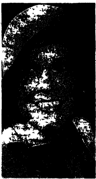
Actress Julie Andrews gives some behind-the-scenes insights on her upcoming movie, "Victor/Victoria," on the syndicated ENTERTAINMENT TONIGHT Thursday, February 11. (Check local listings for exact time and station in your area.)