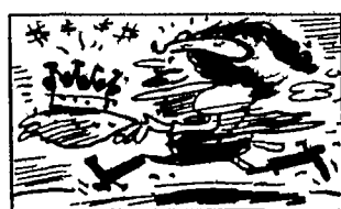
Col. Thomas Blood, a highwayman, stole the British Crown Jewels in 1675 when he was finally caught, King Charles commuted his death sentence and gave him a life-time pension - for being so daring

(3) PINK PANTHER (9) WINTERWORLD SERIES (MON.) (10) BEWITCHED (10) MOVIE 'Catherine The Great' (MON), 'Oklahoma Annie' (TUE), 'Letter Of Introduction' (WED), 'Mr Peabody And The Marmalad' (THUR), 'Back Door To Heaven' (FRI.) (11) SESAME STREET (CLOSED-CAPTIONED) (13) FLINTSTONES (13) THE ADVENTURES OF BLACK BEAUTY 4:35 (4) LEAVE IT TO BEAVER 5:00 (2) BARNABY JONES (6) MARY TYLER MOORE SHOW (1) MISTER ROGERS (7) THAT SHOLLYWOOD (WED.) (7) HUNTER'S GOLD EPISODE 9 (MON.) Movie (TUE) 'Little Boy Lost', Hunter's Gold Episode 10 (WED) (11) HAPPY DAYS AGAIN (1) INCREDIBLE HULK (9) COLLEGE BASKETBALL (MON, THUR.) (10) M A S.H. (12) HOUR MAGAZINE (12) CNN AFTERNOON CONTINUES (13) TOM AND JERRY (13) LIVEWIRE 5:05 (4) BRADY BUNCH 5:30 (3) BEVERLY HILLBILLIES (1) NEWS (1) 3-2-1 CONTACT (EXC WED., FRI.) (7) EYEWITNESS NEWSMAGAZINE (7) MOVIE (MON., WED.) 'Popeye' (MON), 'The Seal Pup' (WED), 'Gooling Around With Donald Duck' (THUR) (11) LAVERNE AND SHIRLEY AND COMPANY (1) TIMMIE AND LASSIE (9) ESPN'S SPORTS-WOMAN (TUE.) PKA Full Contact Karate (WED) (10) BRADY BUNCH (11) MISTER ROGERS 5:35 (4) BEVERLY HILLIBILES