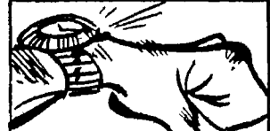
The first wristwatch of which there is any record dates from 1790, and is itemized in the accounts of the Swiss watchmakers Jaquet-Droz and Leschot of Geneva as "a watch to be fixed on a bracelet."