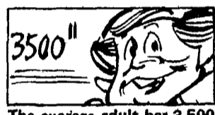
The average adult has 3,500 square inches of skin