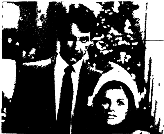
Sam Elliott, stars as a Houston doctor who marries a divorcee (Katharine Ross) only two months after his late socialite wife had unexpectedly died in "Murder in Texas," a four-hour drama to be rebroadcast on Monday, Sept. 13 on "NBC Monday Night at the Movies," and Tuesday, Sept. 14 on "NBC Movie of the Week."