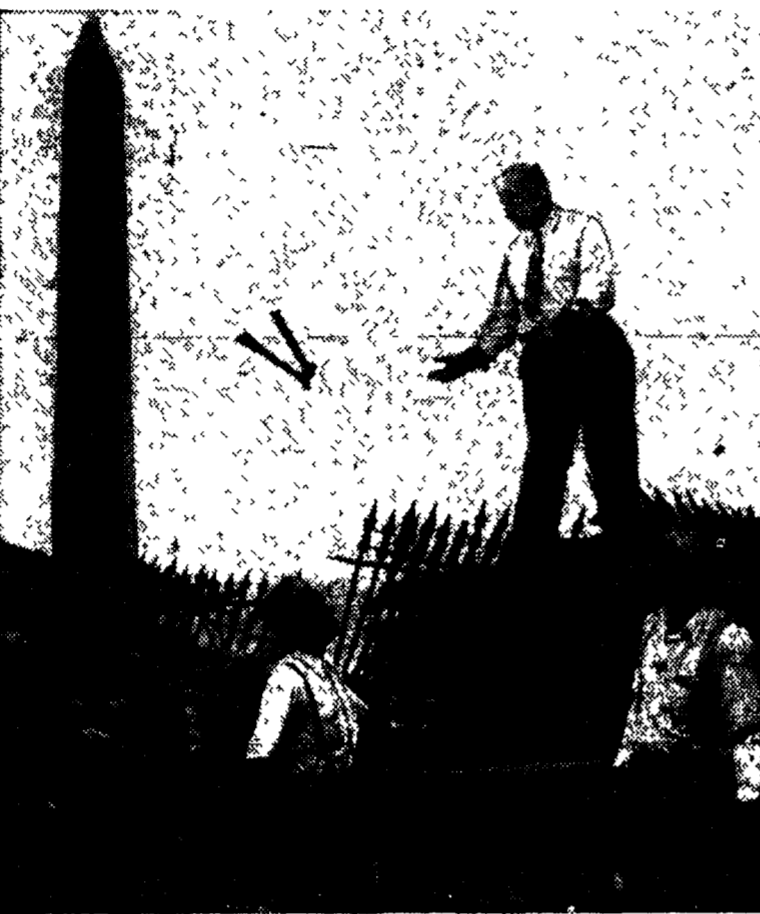
The national scrap drive plays no favorites. Photo shows Harold L. Jakes, secretary of the interior, tossing part of a fence that once surrounded the White House into the interior department's scrap metal collection. The old fence was replaced in 1937 by a newer and higher fence.