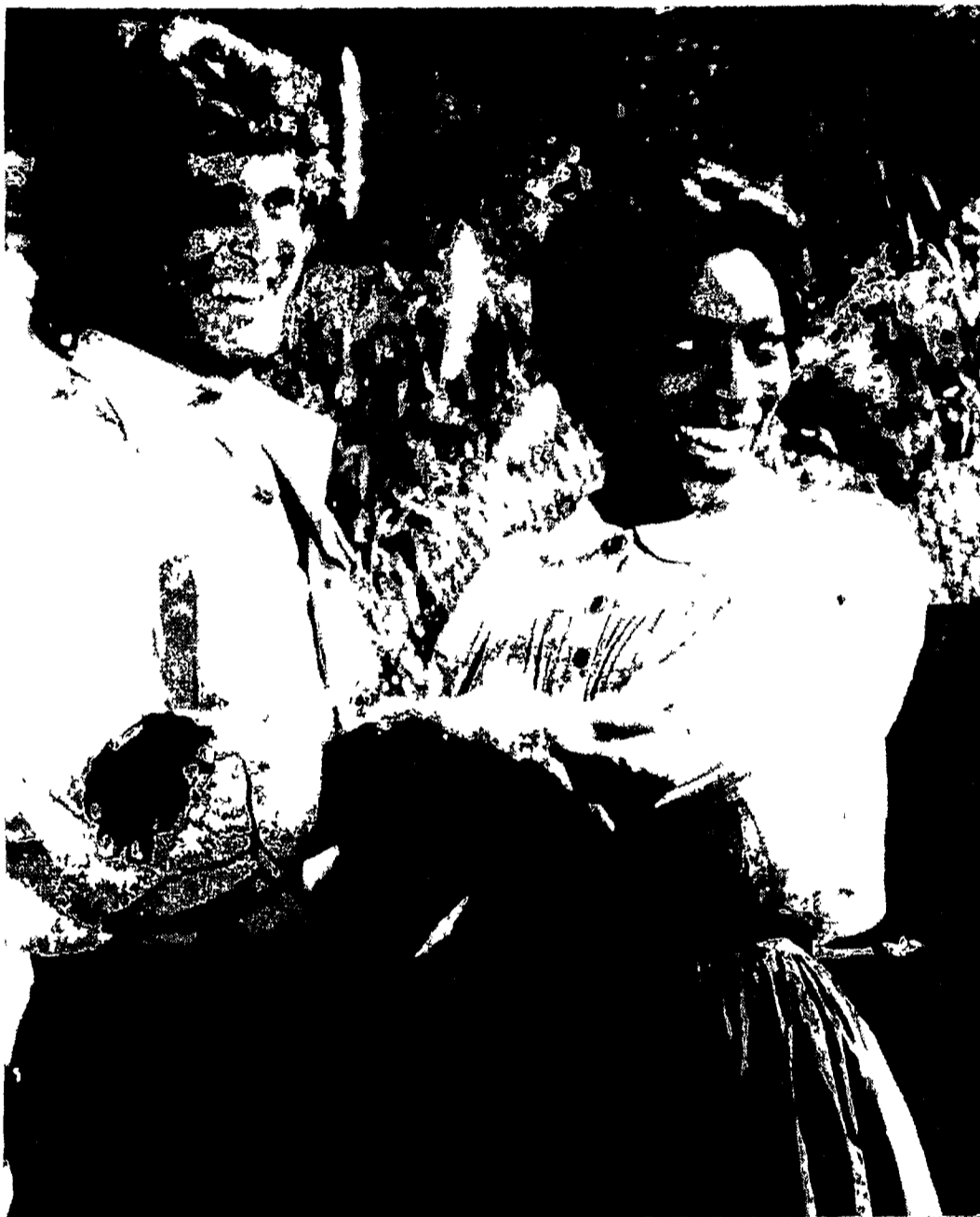
Charles Ingalls (series star Michael Landon) tries to advise Hester Sue (Ketty Lester) when her ex-husband, a hard-drinking gambler who had abandoned her years earlier, arrives in Walnut Grove and asks for another chance to rebuild their marriage in "The Second Chance" episode of "Little House on the Prairie," airing Monday, Aug. 2 on NBC.