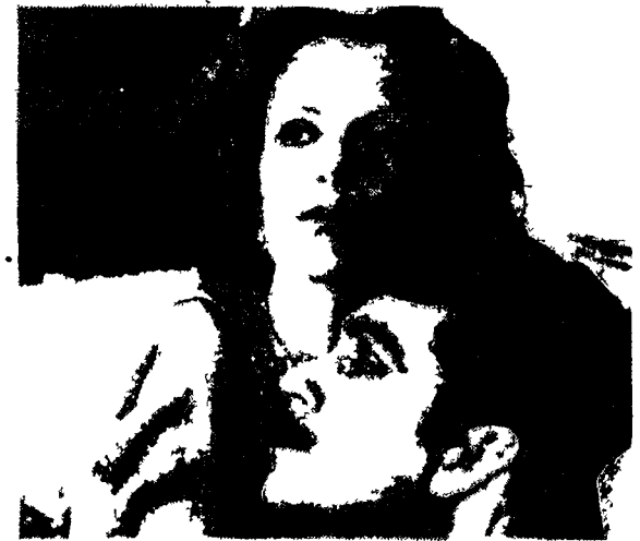
Swedish actress Kristina Wayborn plays Greta Garbo and Barry Bostwick portrays John Gilbert, two early film stars who became Hollywood legends, in "Silent Lovers," a segment of "Noviola," Garson Kanin's best-selling novel, airing on "NBC Monday Night Movies," Monday, Aug. 2.

(NBC) MONDAY NIGHT AT THE MOVIES "NOVIOLA" Barry Bostwick, Kristina Wayborn, Brian Keith, Audra Lindley, Mackenzie Phillips Why did actor John Gilbert's career mysteriously end at the beginning of talking movies? His love, Greta Garbo, isn't talking.