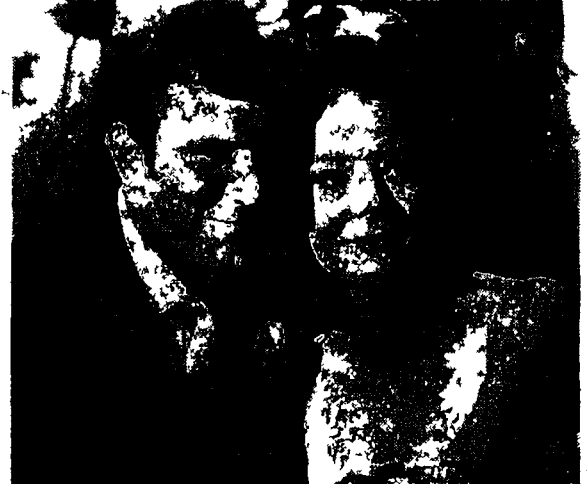
Love lifts its dangerous head when George Lazenby — as special agent James Bond — meets Diana Rigg and plans a wedding in "On Her Majesty's Secret Service," airing on "The ABC Sunday Night Movie," Sunday, Aug. 1.

(ABC) SUNDAY NIGHT MOVIE "ON HER MAJESTY'S SECRET SERVICE" George Lazenby, Diana Rigg In this 1969 James Bond adventure 007 falls hard for a Spanish contessa but gets up in time to save the day and the world