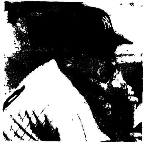
Yogi Berra, a veteran of many All-Star games during the 1950s and '60s, will be the honorary captain of the American League squad when the best of today's major leaguers battle in this year's mid-summer classic. ABC airs the action from Montreal's Olympic Stadium on Thursday, July 13.