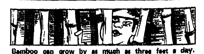
Bamboo can grow by as much as three feet a day.