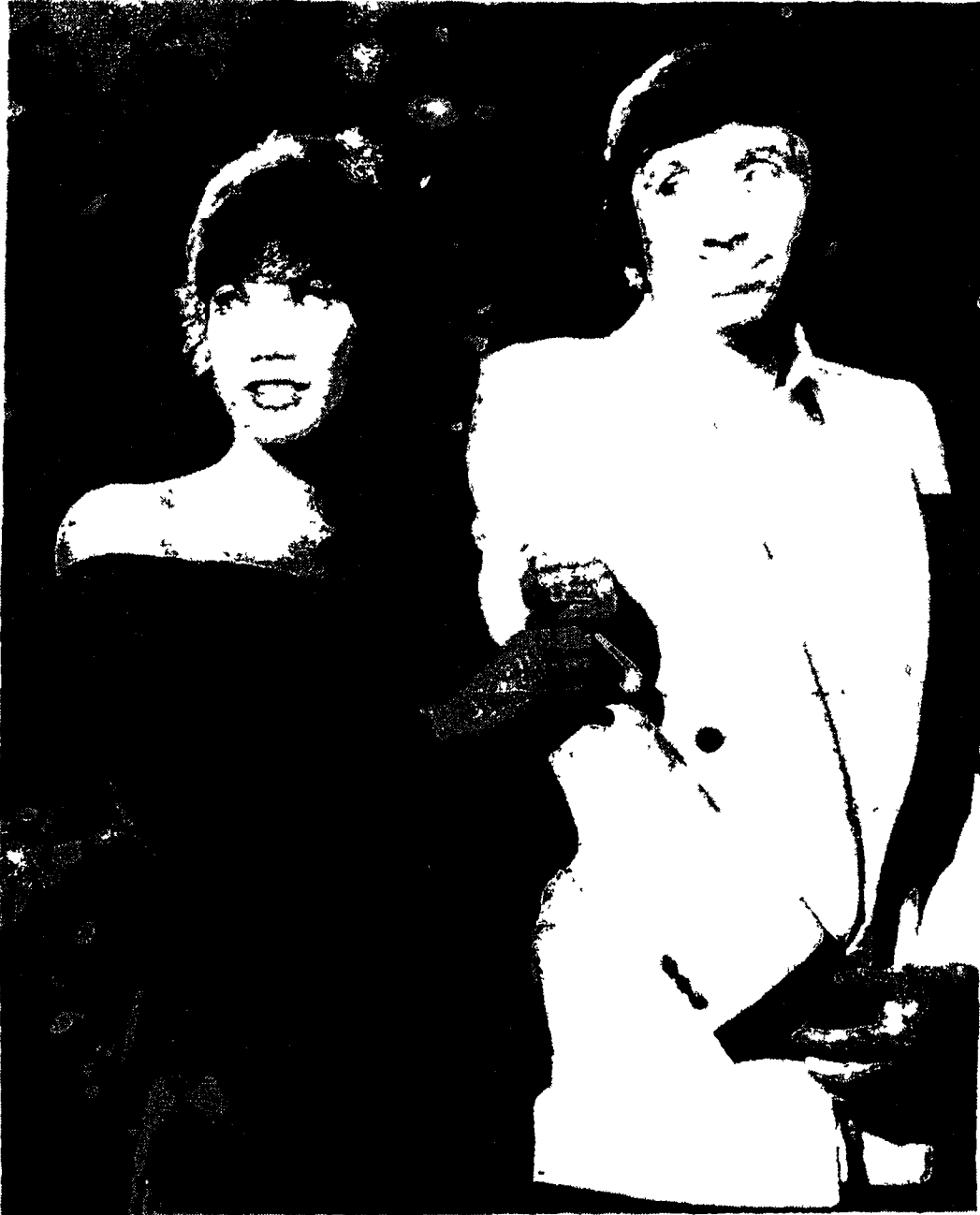
Gilligan's Playmate? Bob Denver, rubber-faced star of the classic 1960s sitcom, "Gilligan's Island," plays a window dresser who wants to bring to life his favorite mannequin played by Barbi Benton, the former Playboy centerfold. This oddest of couples are the guest stars on the July 17 episode of ABC's "Fantasy Island."