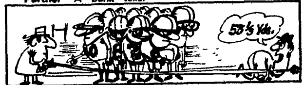
Most sports fans know the length of a football field (120 yards including end zones) but few know its width...which is 53 and one third yards.