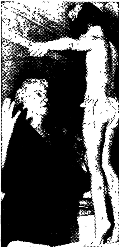
Another child is added to the many cured of the crippling effects of infantile paralysis via the Kenny method. Sister Kenny encourages a five-year-old to stand on her tip-toes in Jersey City, N. J.