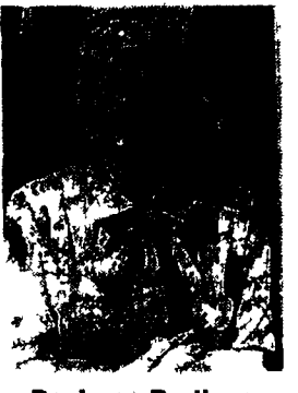
Dr. Joyce Brothers

"Cable News Network has given me a wonderful platform," says psychologist Dr. Joyce Brothers who examines all facets of human behavior in her five weekly 90-second essays on the Turner Broadcasting System. Her essays cover a wide variety of topics from how to choose your friends to the popularity of country music. "What I do for Cable News Network, is never heard anywhere else," Dr. Brothers says "I have researchers all over the world who enable me to report on developments long before they get into medical literature. It is an enormous responsibility and I am very proud of it. "What I am doing in my reporting, is simply talking as clearly as I can about very complicated things," Dr. Brothers says "I speak straightforwardly so that people can understand I never talk down to anyone. I report as if I were talking to a friend."