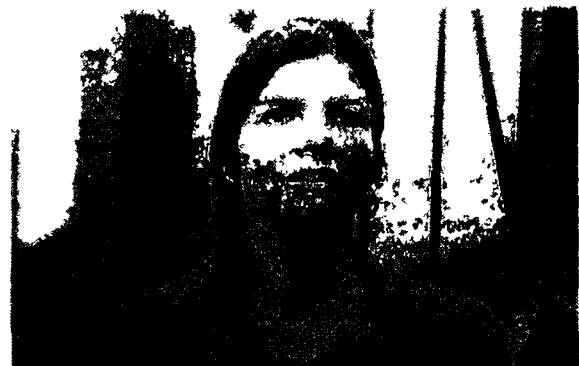
Katharine Ross plays an architect in the 1979 film, "The Legacy," who learns she has been selected by evil forces to receive the power being passed on by an elderly man who is under the influence of the devil Sam Elliott co-stars in the film, which airs on NBC, Sunday, July 18

SUNDAY (NBC) SUNDAY NIGHT AT THE MOVIES "THE LEGACY" (1979) Katharine Ross, Sam Elliot Death, satanic happenings and the occult co-star when two Americans end up in an English mansion