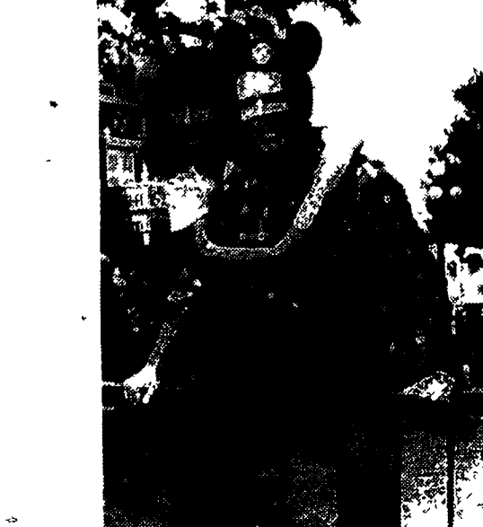
Michele Lee and Dean Jones engage in horseplay as the mother and father of a fictional Midwestern family, the Lanes, who visit Walt Disney World, on KRAFT SALUTES WALT DISNEY WORLD'S 10TH ANNIVERSARY , a new one-hour special, Thursday, January 21 on CBS-TV

day's reports 2:45 (1) (2) CHARLES CAPPS: CONCEPTS OF FAITH 3:00 (4) MOVIE-(DRAMA)*** 'Whiplash' 1945 Dane Clark, Alexis Smith An extremely talented artist is turned into a 'kill-happy' and bitterly morose prizefighter (2 hrs) (6) (7) (8) (9) (10) (11) (12) (13) TODAY IN CHICAGO (1) (2) (3) (4) (5) (6) (7) (8) (9) (10) (11) (12) (13) PATTERN FOR LIVING (1) (2) (3) (4) (5) (6) (7) (8) (9) (10) (11) (12) (13) NIGHT BEAT (9) NFL STORY: LINE BY LINE (R) (10) JACK BENNY (11) NITE OWL (CONTINUES) 3:19 (7) LEAVE IT TO THE WOMEN 3:30 (1) (2) (3) (4) (5) (6) (7) (8) (9) (10) (11) (12) (13) MEDITATION (1) (2) (3) (4) (5) (6) (7) (8) (9) (10) (11) (12) (13) GOD'S NEWS BEHIND THE NEWS (1) (2) (3) (4) (5) (6) (7) (8) (9) (10) (11) (12) (13) MOVIE-(COMEDY-MYSTERY)*** 'Whistling In Brooklyn' 1943 Red Skelton, Ann Rutherford A radio amateur criminologist finds himself in hot water with the police, a murderer and the Brooklyn Dodgers (2 hrs) (9) TOP RANK BOXING