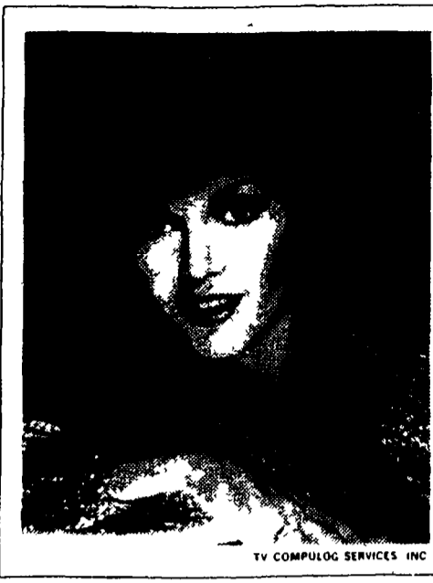
TV COMPUTLOG SERVICES INC