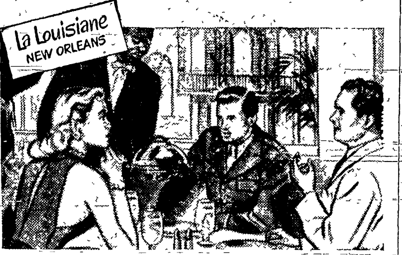
This world-famous old French restaurant chooses Gas... the world's finest cooking fuel... never to be forgotten delicacies such as Shrimp Jambalaya, Bouillabaisse and Pompano en Papillote.