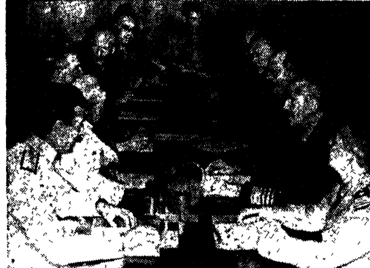
Chiefs of staff of the army and navy of the United States and Great Britain gather around a conference table to formulate new plans to cause the continued retreat of our common enemies.