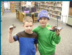
Lego creations made at Boyz Night Out.