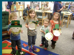
Leprechaun crafts for St. Patrick's Day